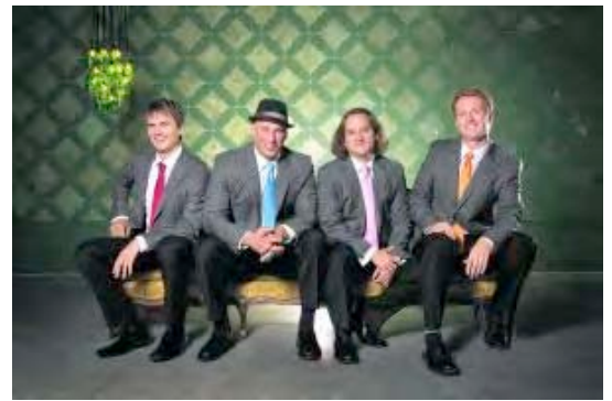
The Four Freshmen will sing classics Nov. 12 at the Paramount Center for the Arts in downtown Bristol.